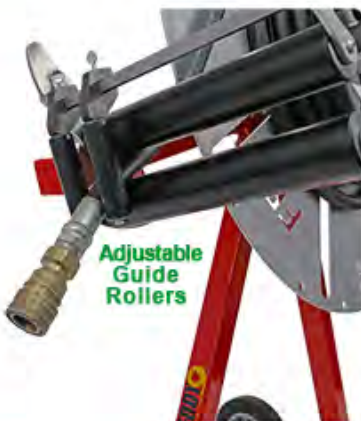
Adjustable Guide Rollers