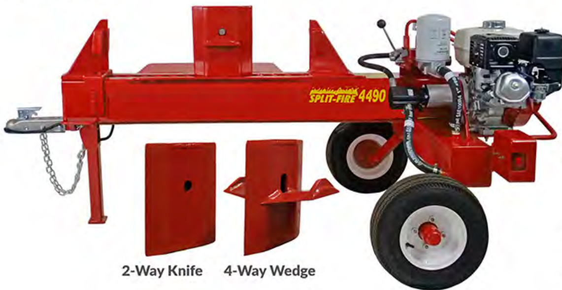
2-Way Knife 4-Way Wedge